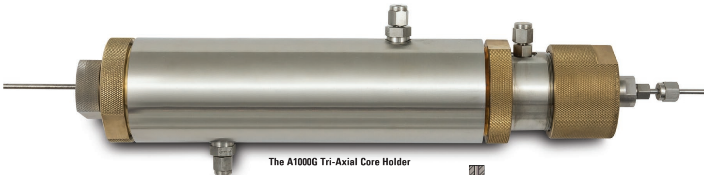
The A1000G Tri-Axial Core Holder