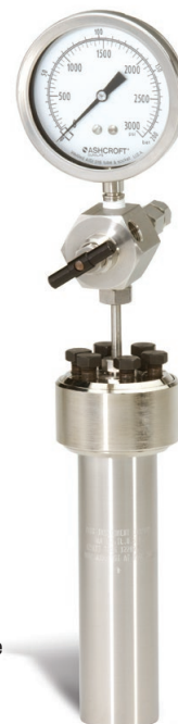
Model 4750-200mL-A Vessel, with 4310 Gage Block Assembly.