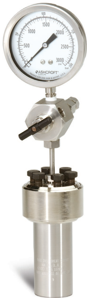
Model 4750-125mL-A Vessel, with 4310 Gage Block Assembly.