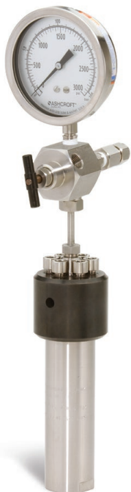
Model 4740-75mL-A Vessel, with 4310 Gage Block Assembly.